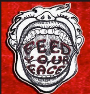
FEED YOUR FACE