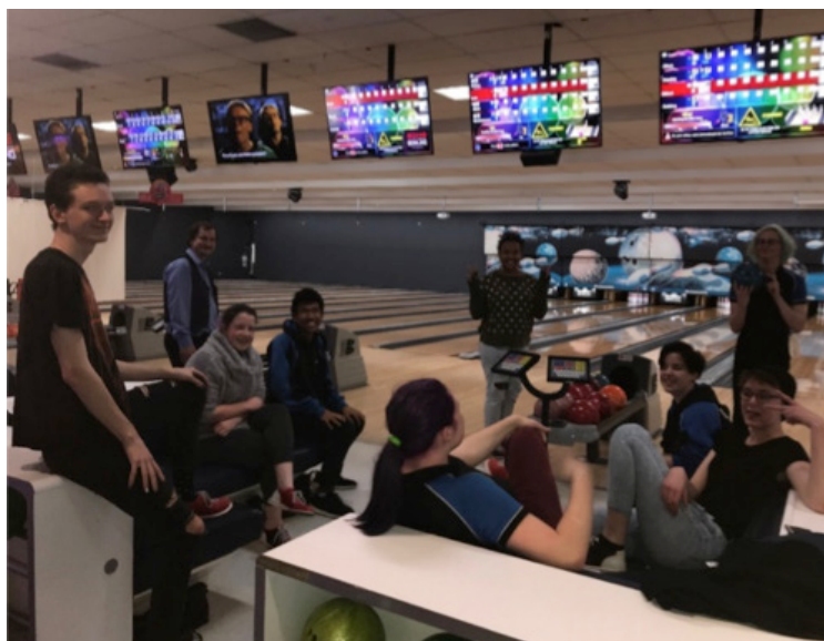
GUNGAHLIN COLLEGE'S STUDENT, STAFF & FAMILIES RAINBOW BOWLING SOCIAL, TEAM-BUILDING EVENING

Some of these youth do not have fixed addresses, but know they can attend, connect and learn. The program is focused on supporting young people and staff, across government and non-government networks, everyone is welcome!