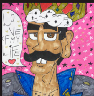
POP IN AND PAINT